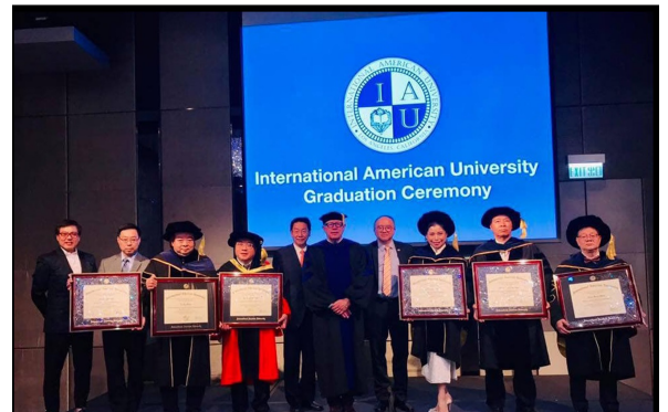
2019 Hong Kong