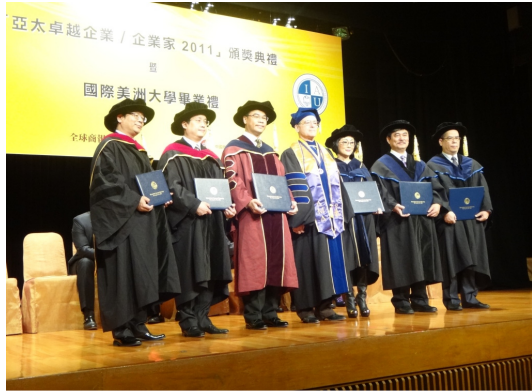
2011 Hong Kong