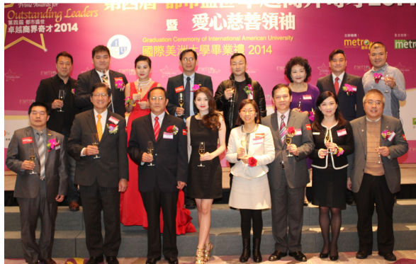
2015 Hong Kong