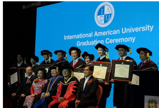
2018 Hong Kong