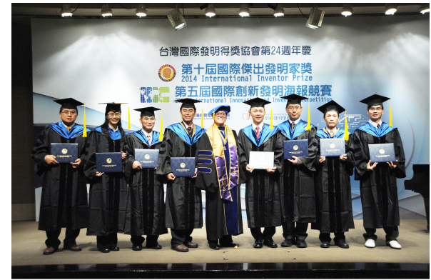
2014 Hong Kong